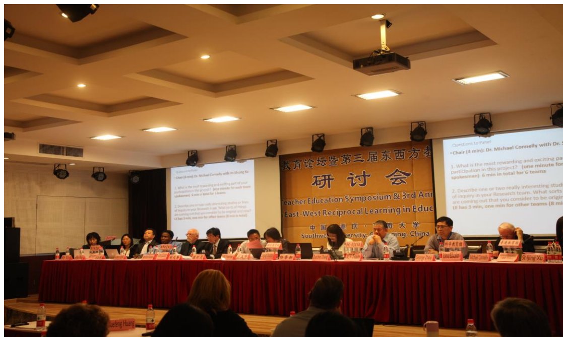
讨论会 3 Panel 3